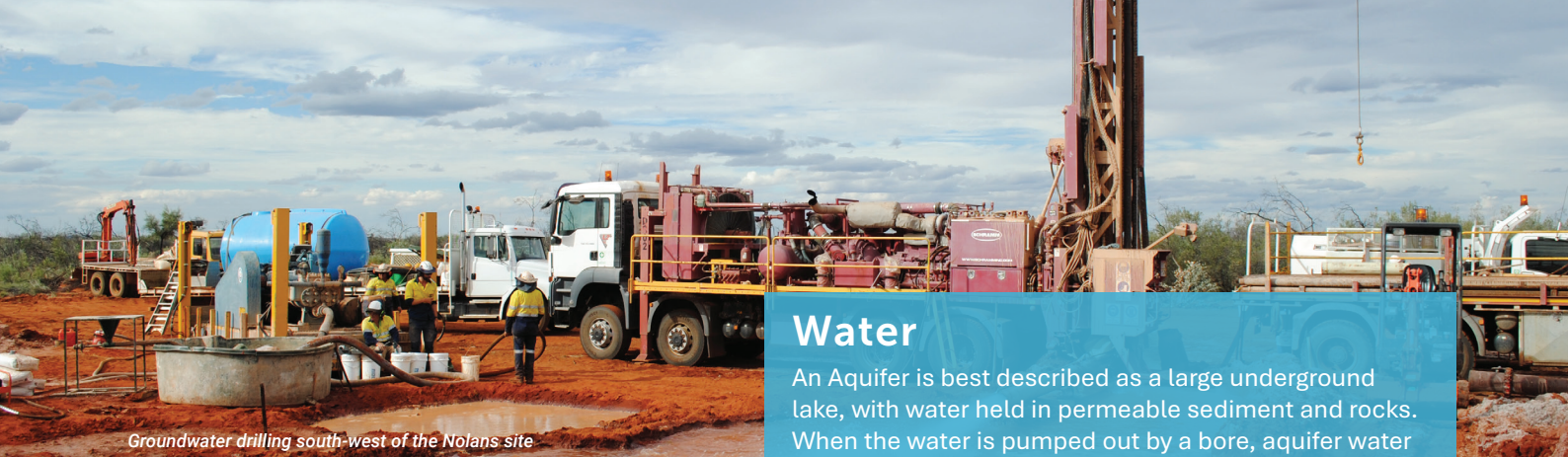
Groundwater drilling south-west of the Nolans site