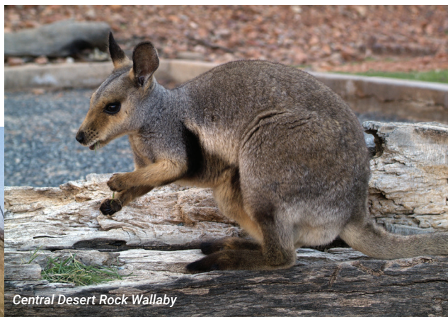
Central Desert Rock Wallaby

A logistics operation in Alice Springs will coordinate the inbound transfer of containers from rail to road trains and outbound transport of rare earth and phosphoric acid products back to Darwin for export.